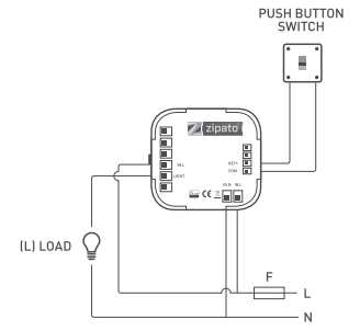
FIGURE 2 Connect with 1 Gang Push Button Switch

Red wire refers to Live IN, blue wire refers to Neutral, and black wire refers to connecting with switch.