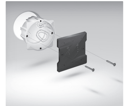
FIGURE 3 Installation with junction box